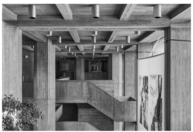
Offenbach Town Hall (brutalist architecture), https://flic.kr/p/2m9LErv