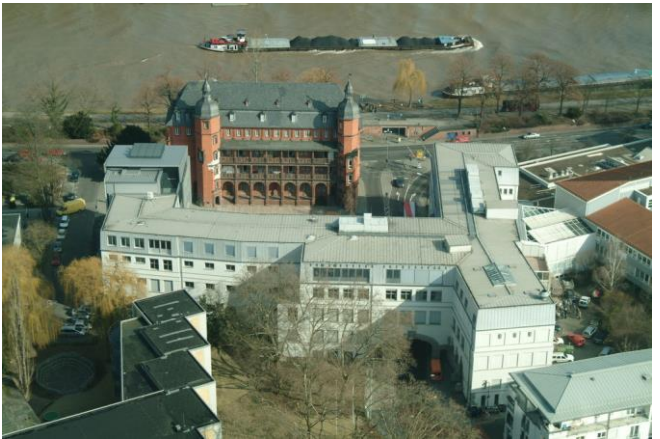
Main Building and Isenburger Schloss

The Offenbach University of Art and Design (HfG) will continue the operation of Germany's second oldest porcelain manufactory with a new concept and use the craftsmanship and artistic know-how for research and teaching.