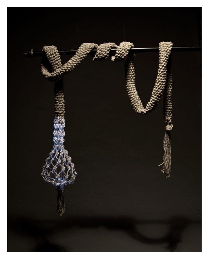
Work by Svantje Fenz